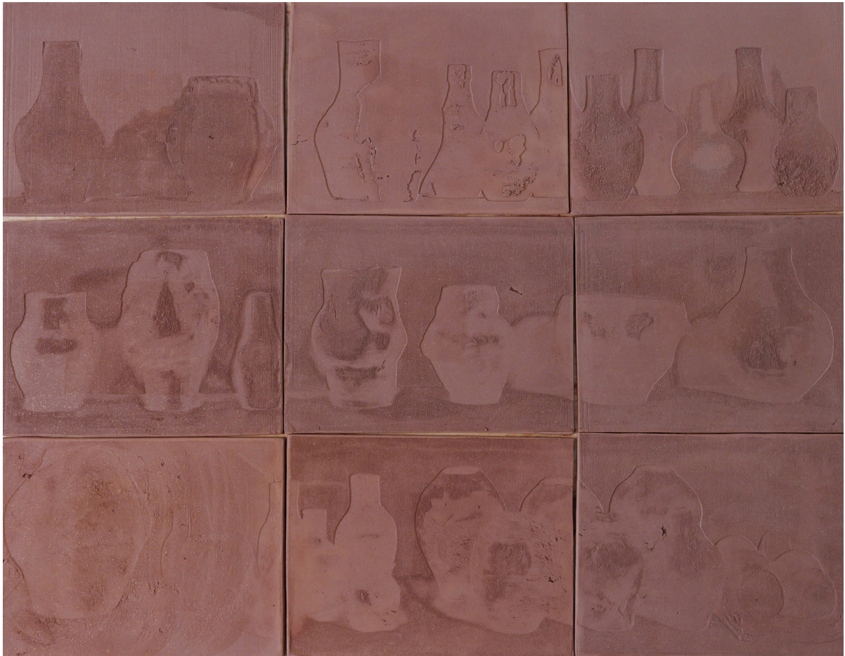
“The artist’s vessels”, clay engraving from a photographic still life. 21 x 29cm. 2025