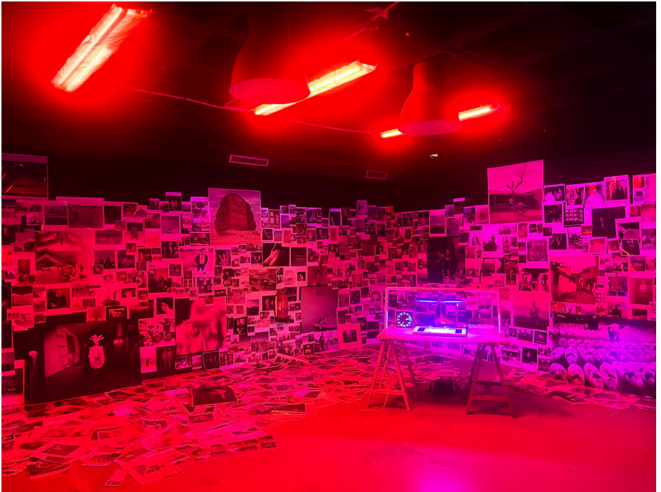
Current work in progress, photographic installation with future clay intervention in video performance format