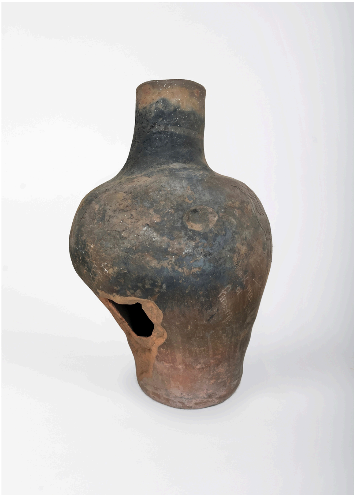
"Catfish" wild spanish clay and pit fired ceramic. 25 x 40cm. 2024