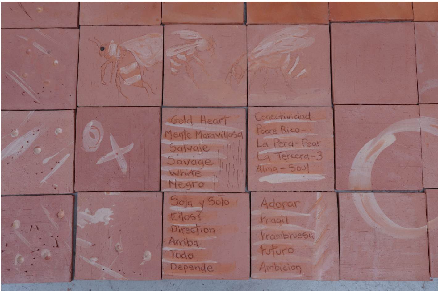
Details of “Las Musas”