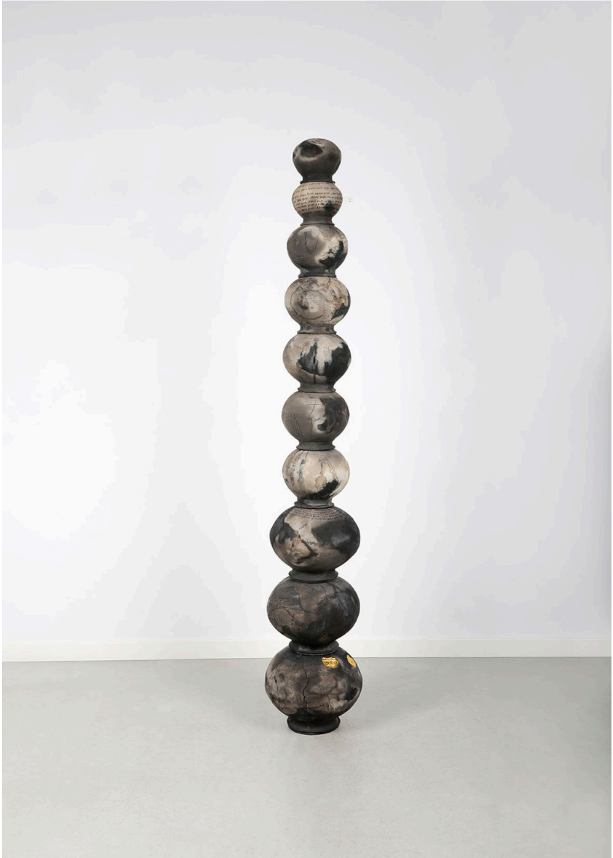
"Indian Totem" Jumble project residency Farm Studio India. 40 x 190cm. 2024.