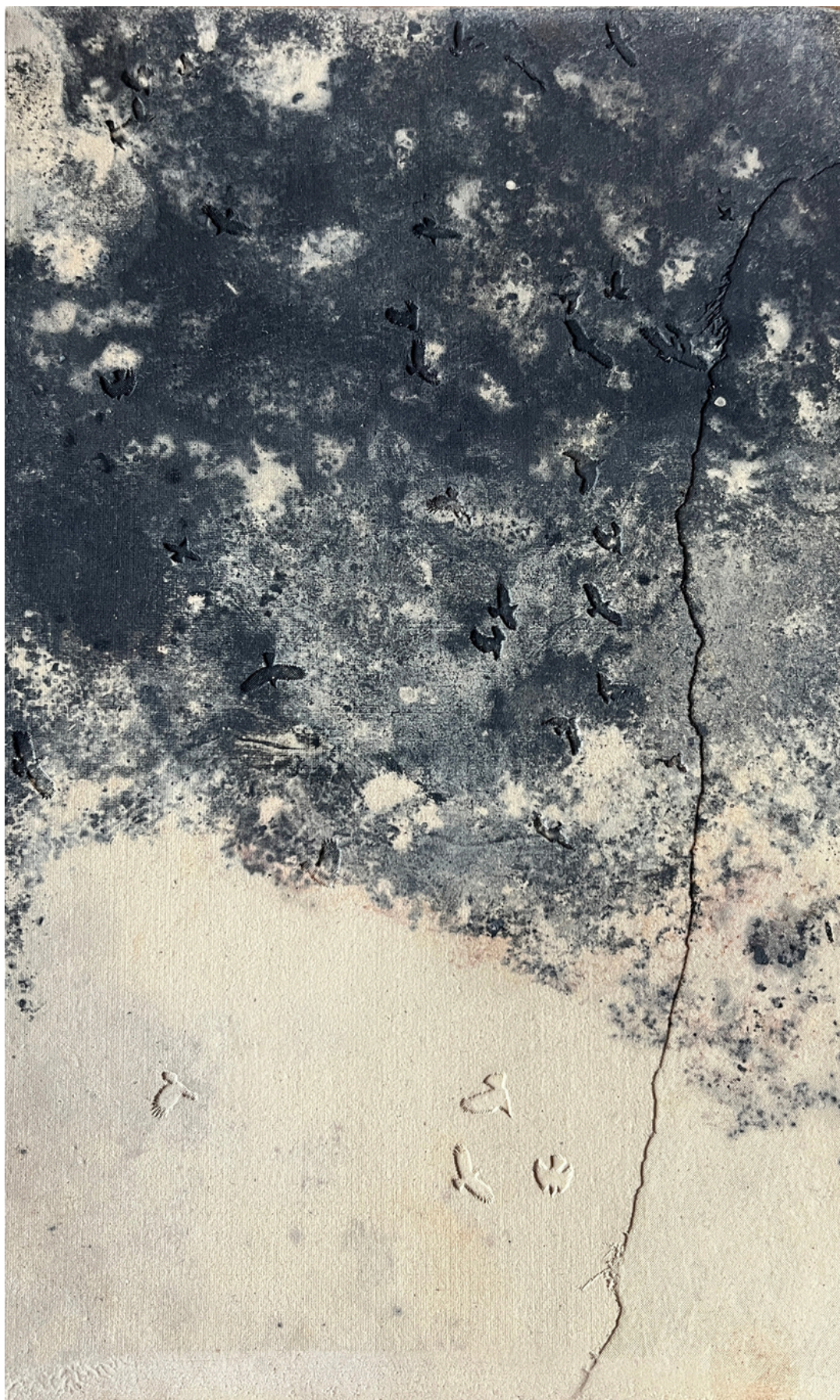
“The Crows of Peñarrubia”, clay pit fired engraving from photographic still life. 21 x 29cm. 2025