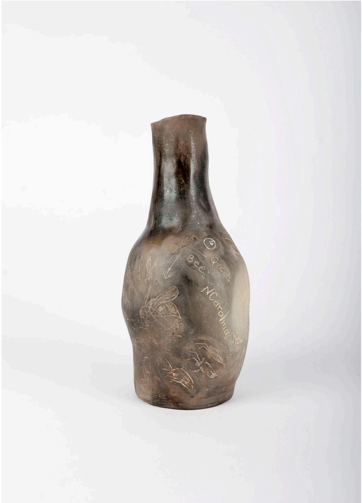
"Loyalty" wild North Carolina clay and pit fired ceramic bottle. 13 x 21cm. 2024