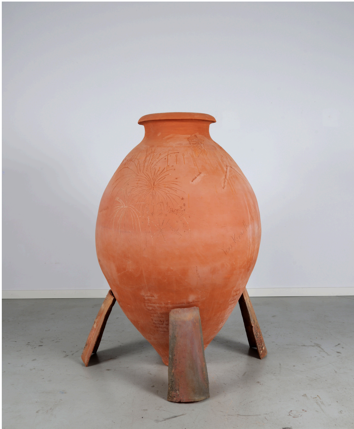
"Selection Theory" wild spanish clay large vessel ceramic work. "La voz es ella" project. 75 x 145cm. 2024