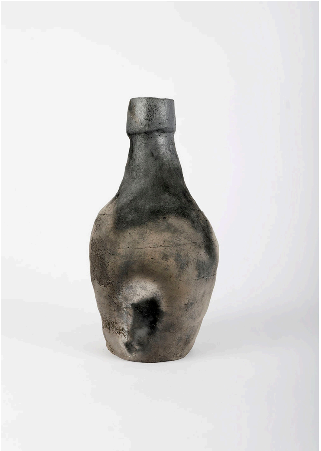
“Buji” wild Indian clay, pit fired ceramic bottle, Jumble project. 12 x 28cm. 2024