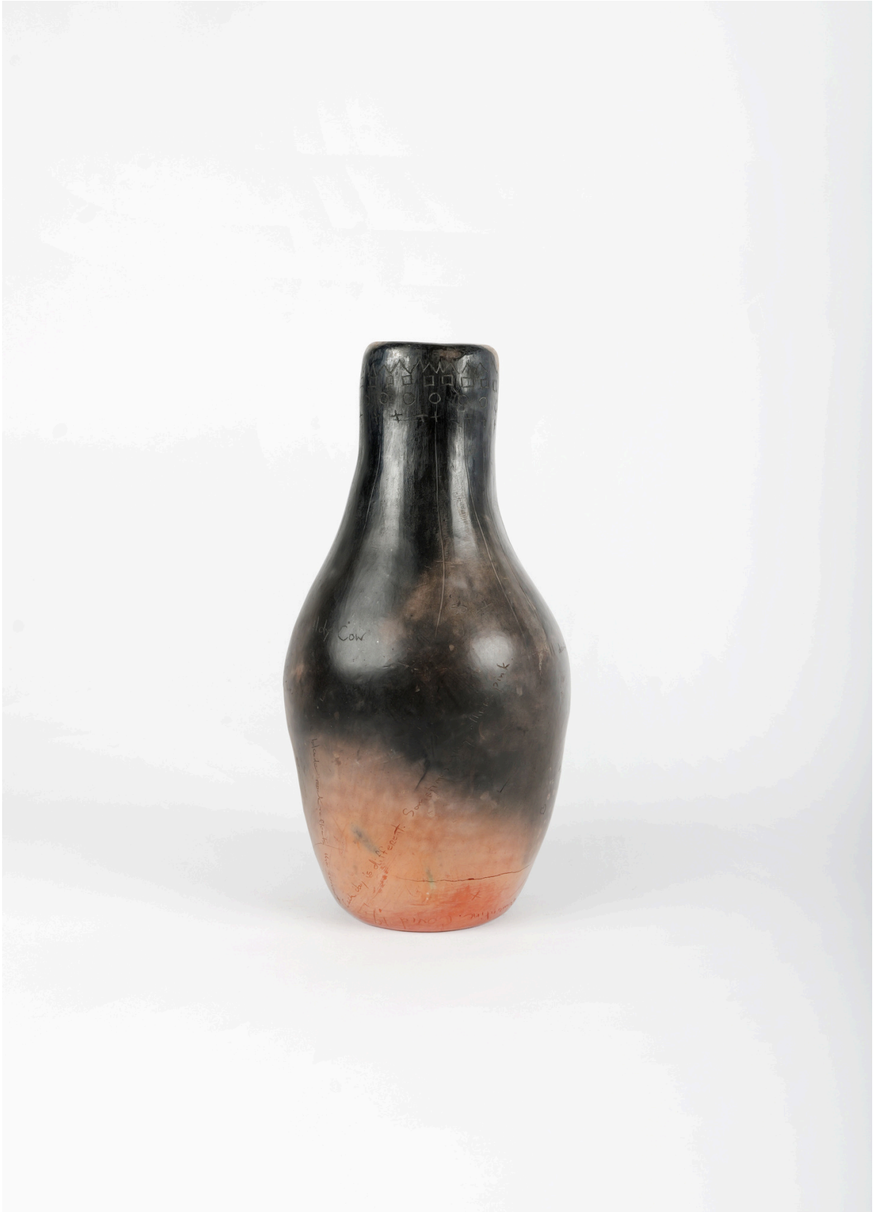
"Holy Cow" wild spanish clay, pit fired ceramic bottle. 12 x 25,5 cm. 2023