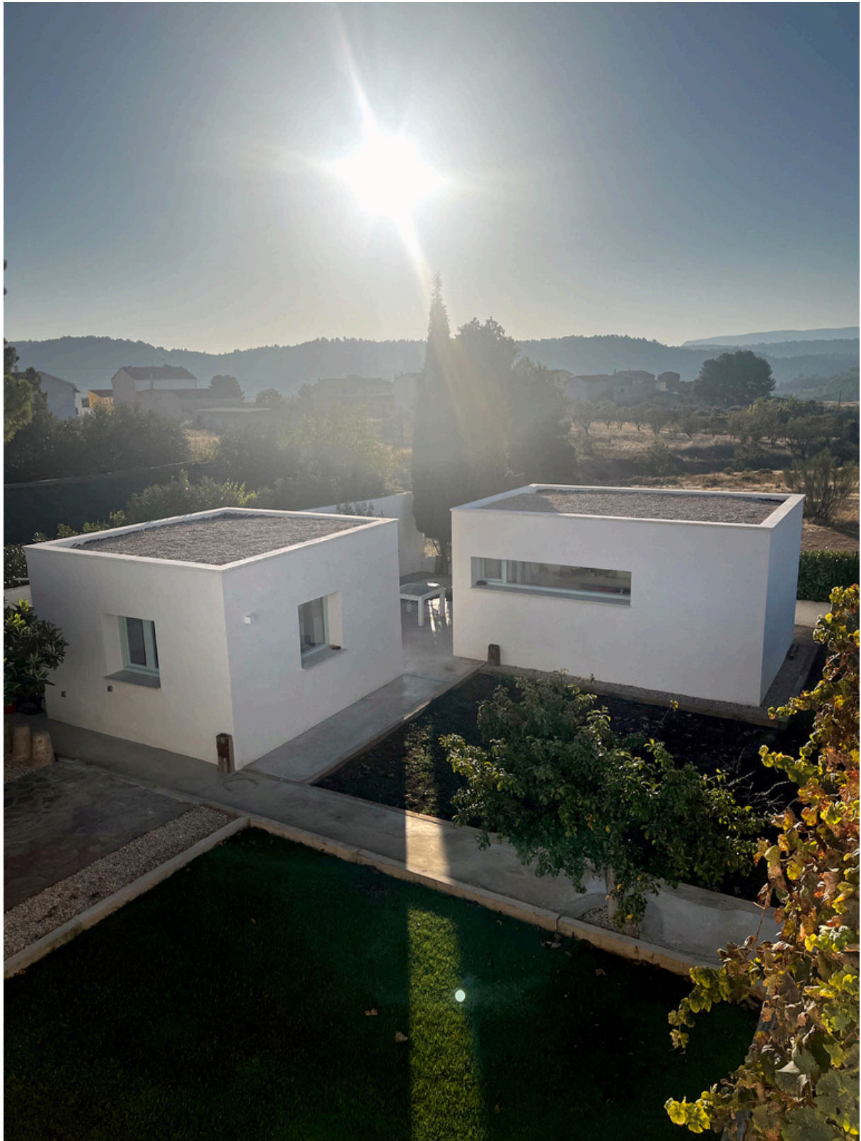
The artist studios in the country, Spain. 2025