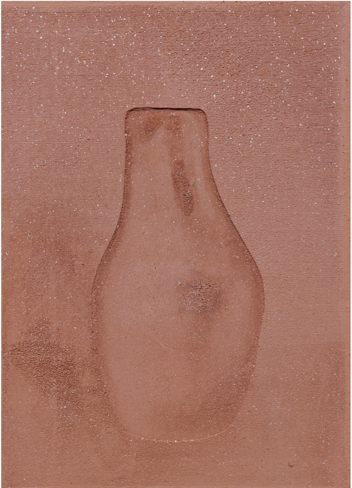
“Holy Cow” bottle, clay engraving from a photographic still life. 21 x 29cm. 2025