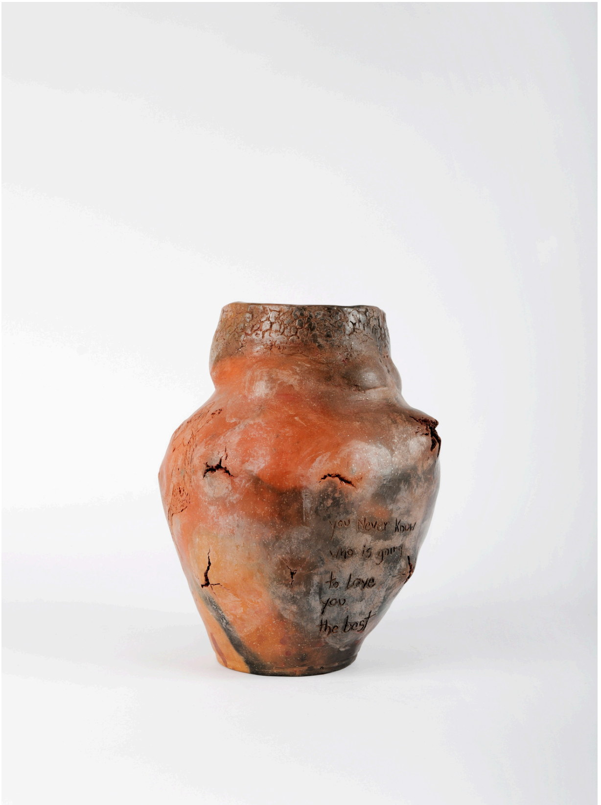
"Tik Tack Toe" wild spanish clay, pit fired ceramic bottle. 22 x 28 cm. 2023