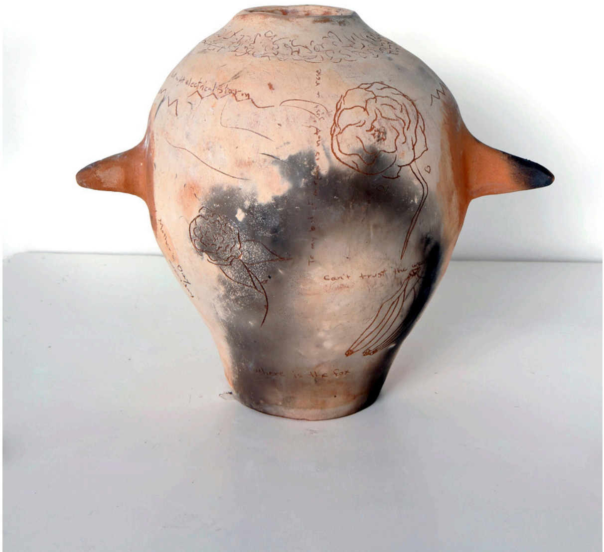
"Electrical Storm" wild spanish clay and pit fired ceramic vessel. 25 x 30cm. 2022