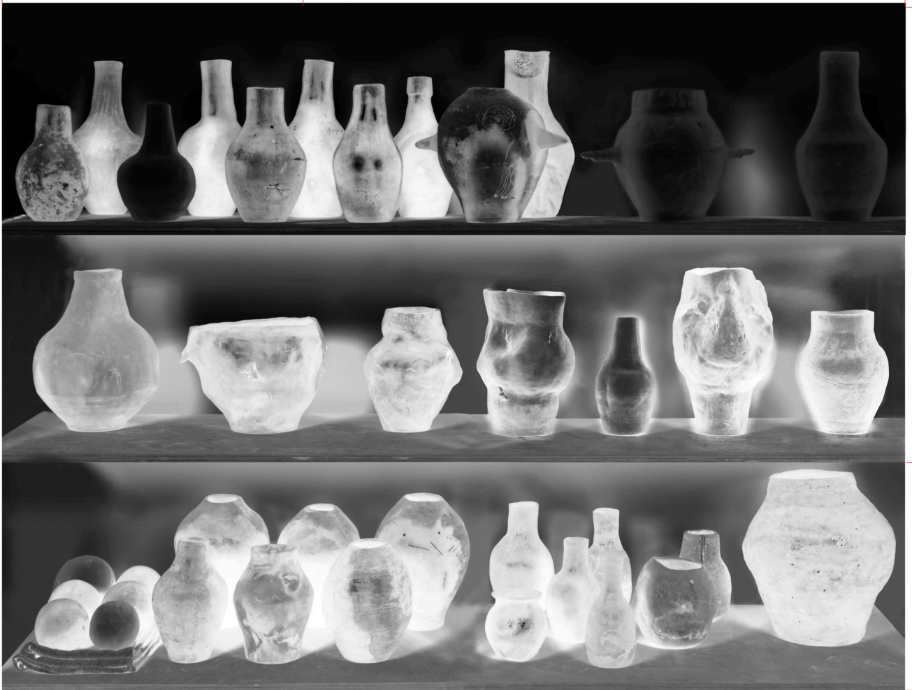
“The artists vessels” inverted photographic still life.