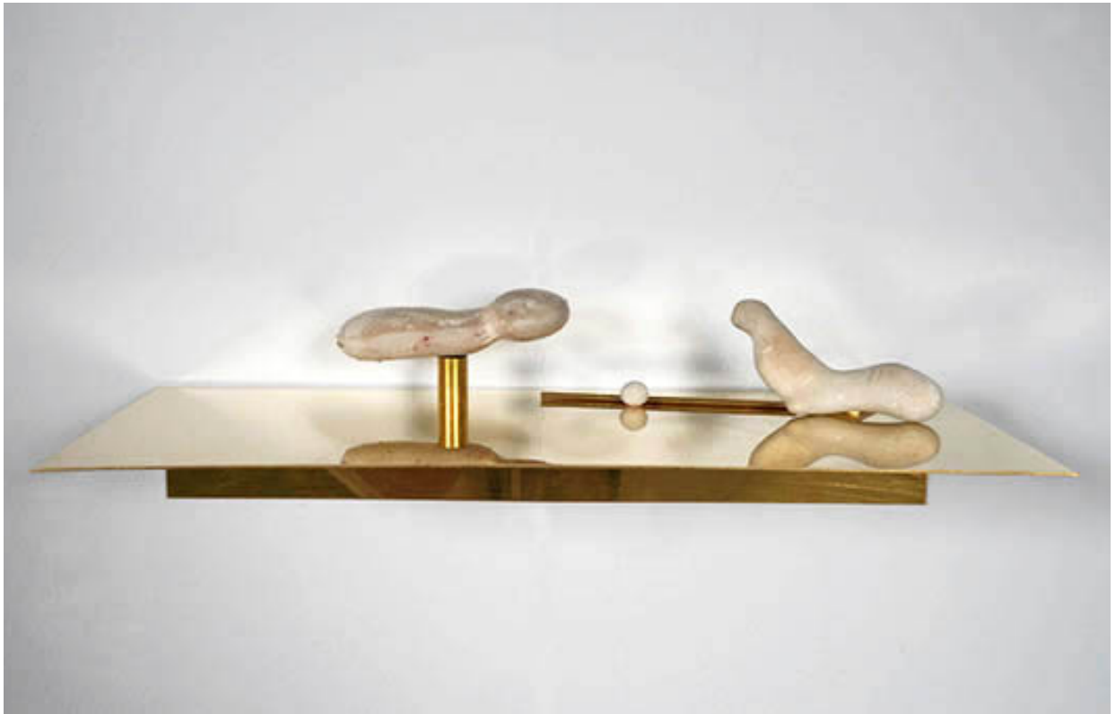
"Balanced Act" sculptural installations of found and reproduced mineraloid opal in clay "idols" from Horno Ciego project. 2023