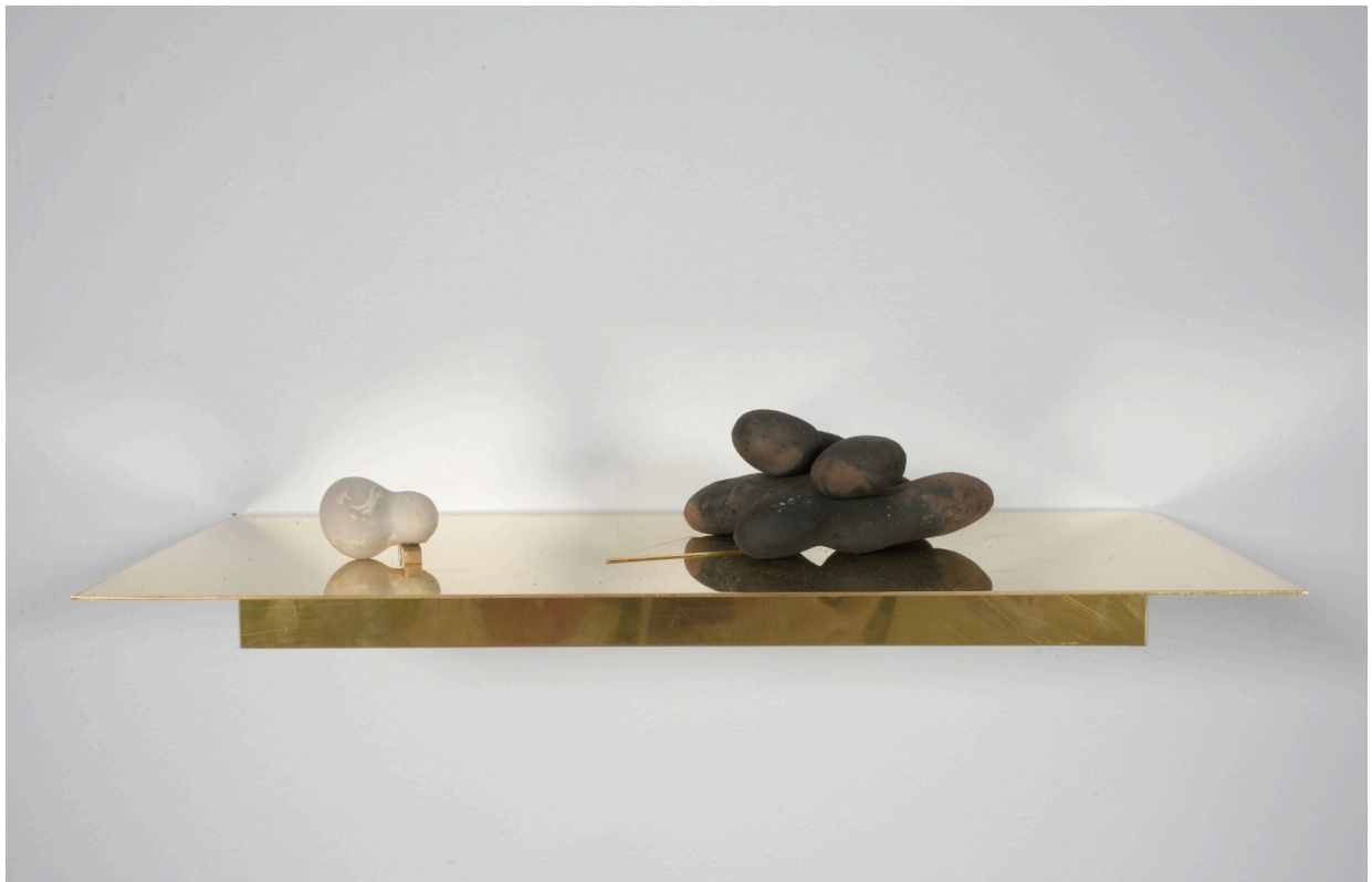
“Big Brothers” sculptural installations of found and reproduced mineraloid opals in clay “idols” from Horno Ciego project. 2023