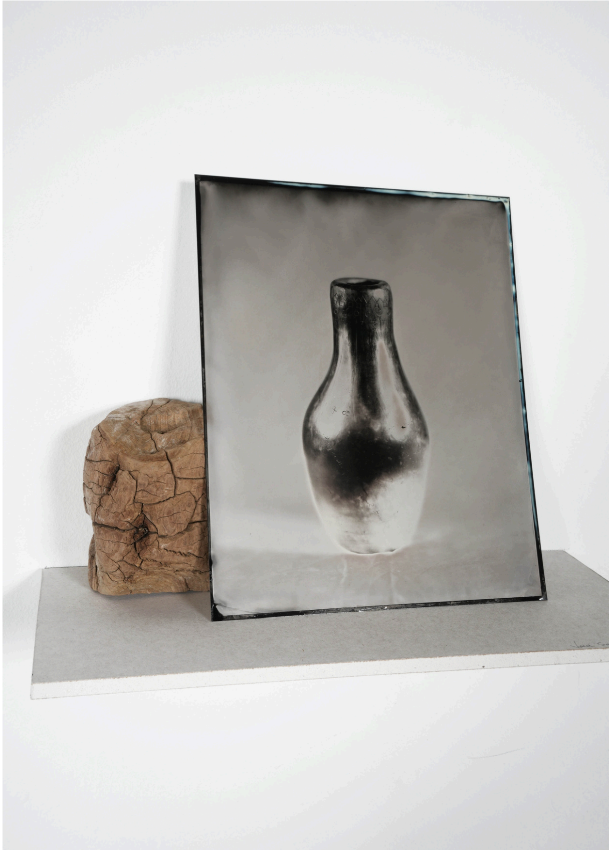
Still life of "Holy Cow" bottle , wet plate collodion, Horno Ciego project. 2023