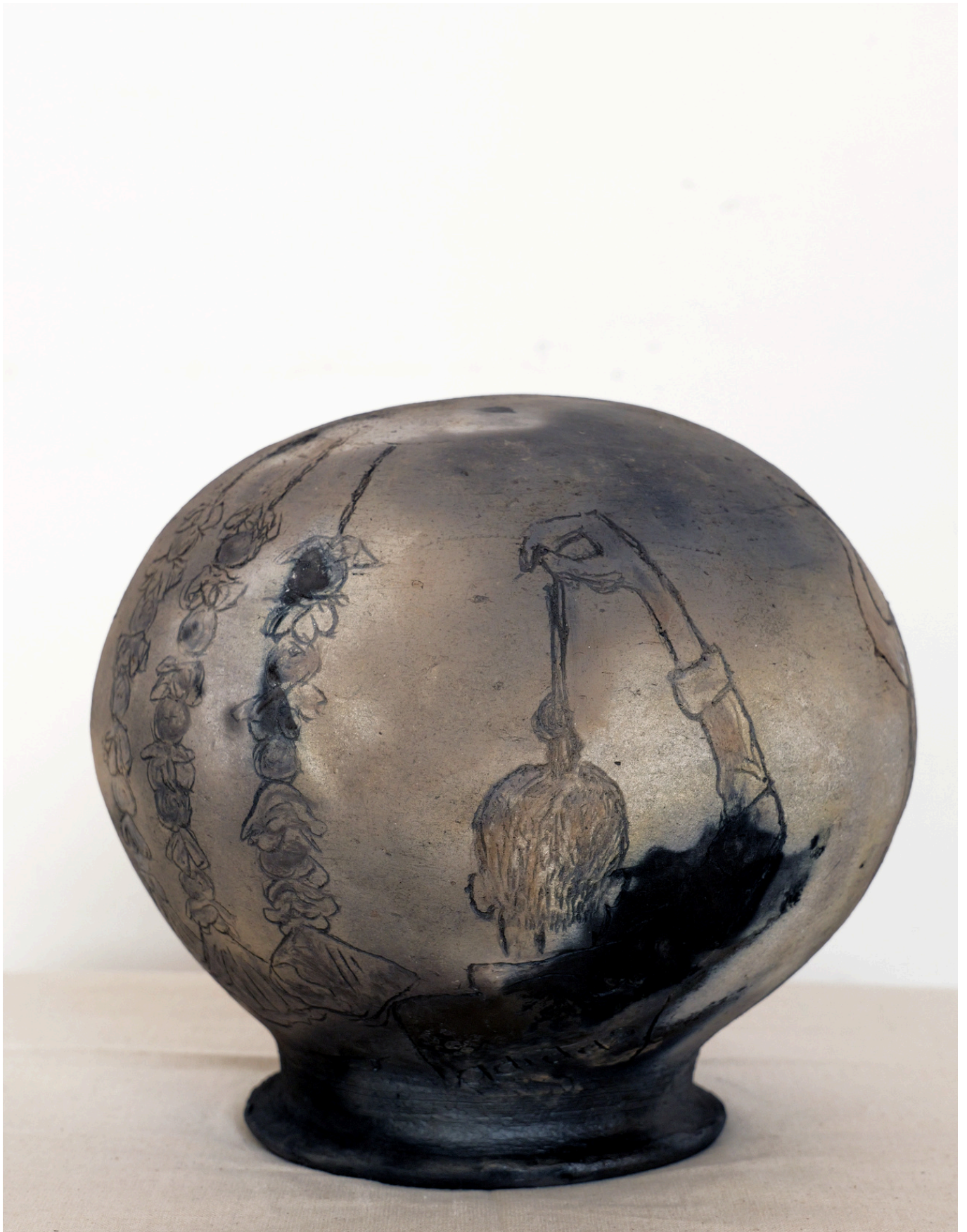
Detail of one of the vessels in "Indian Totem" Jumble project residency Farm Studio India. 2024