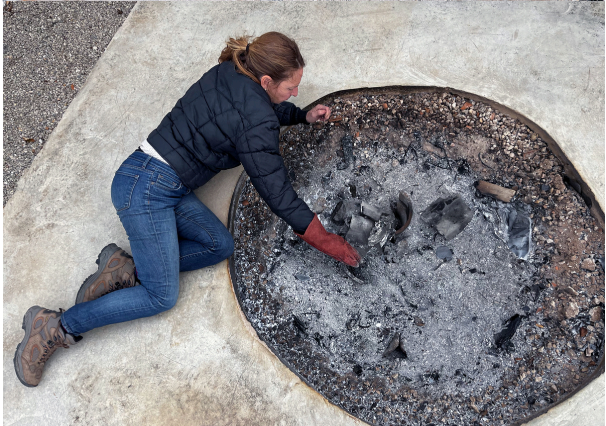
The artist and her pit fire at her country studios, Spain, 2025..