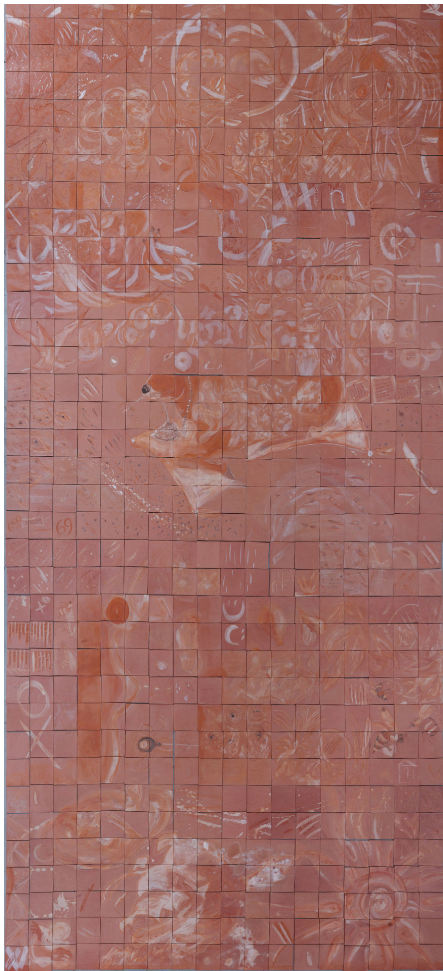
Ceramic Mural "Las Musas" Commissioned Project Los Gabrieles 2025 6 x 3 meters.