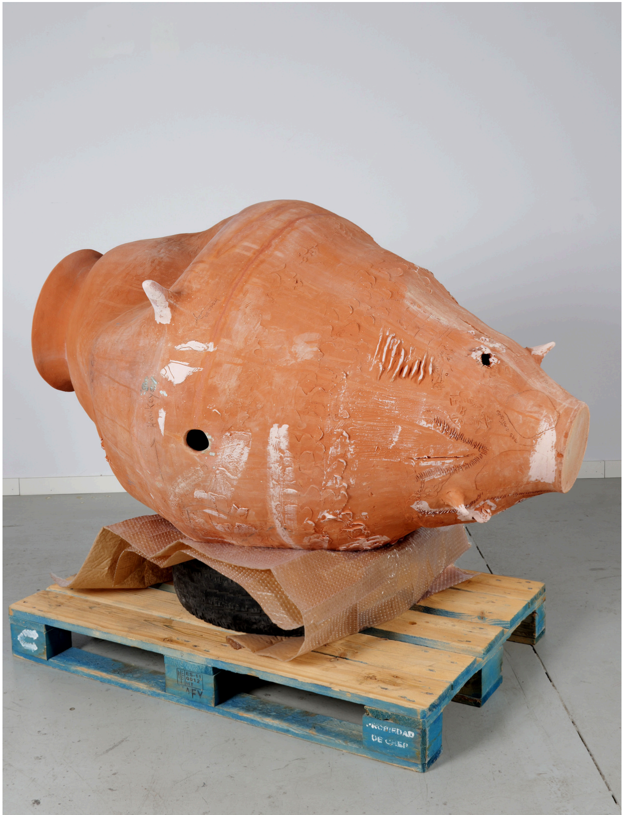
"Pigfish" wild spanish clay large vessel ceramic work. "La voz es ella" project. 75 x 145cm. 2024